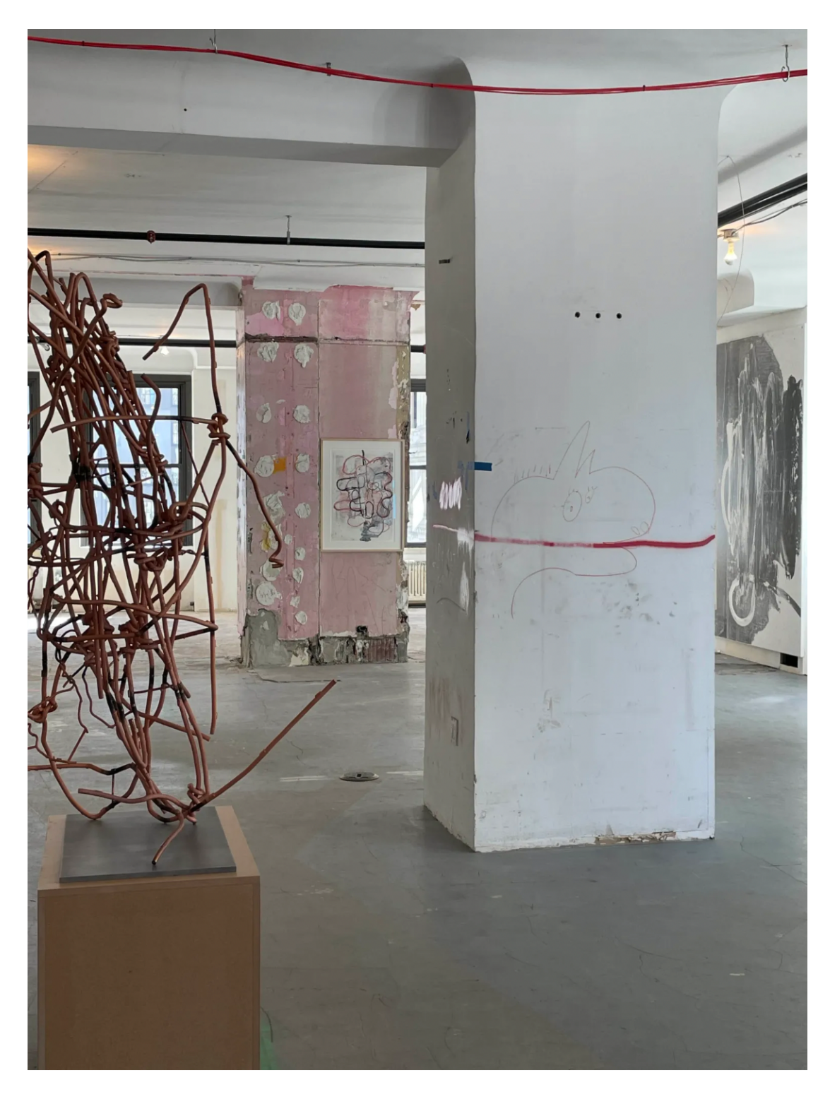
101 Greenwich Street: Christopher Wool, See Stop Run, 2024, Installation View