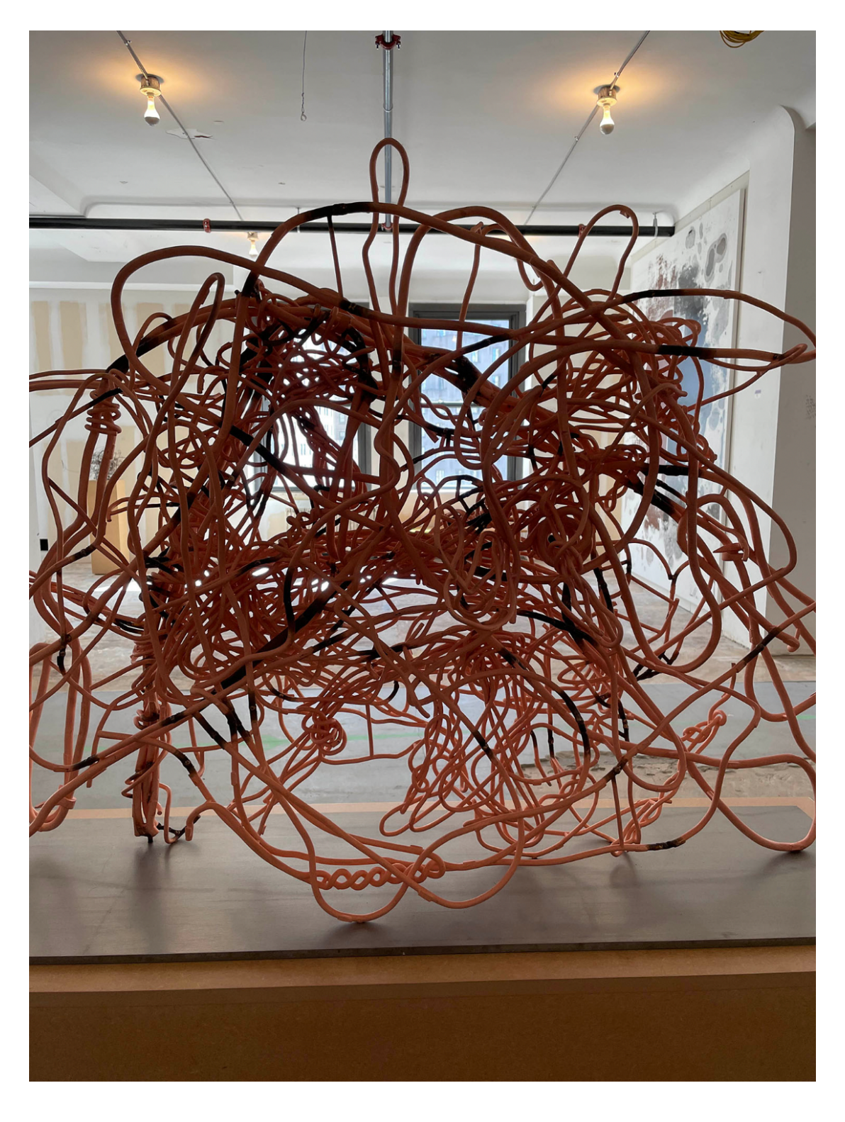
101 Greenwich Street: Christopher Wool, See Stop Run, 2024, Installation View