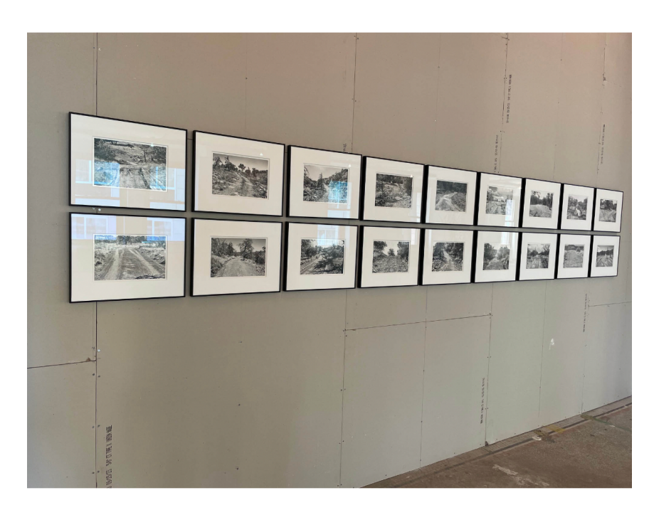
101Greenwich Street: Christopher Wool, See Stop Run, 2024, Installation View

Some of the sculpture consists of ready-mades – found balls of tangled fencing or baling wire from around his home in Marfa, Texas. Other sculptures appear to be found but are not, or not entirely. Still others are bronze castings from wire or steel cable. Whether they are fashioned or simply discovered feels unimportant in the larger context of the show, which facilitates an open-ended dialogue between the made and the found, the spontaneous and the mechanical, the remarkable and the ordinary. The wire tangles do the work of traditional sculpture: looping arabesques sitting on pedestals, the pedestals striking an interestingly discordant note in an untraditional setting.