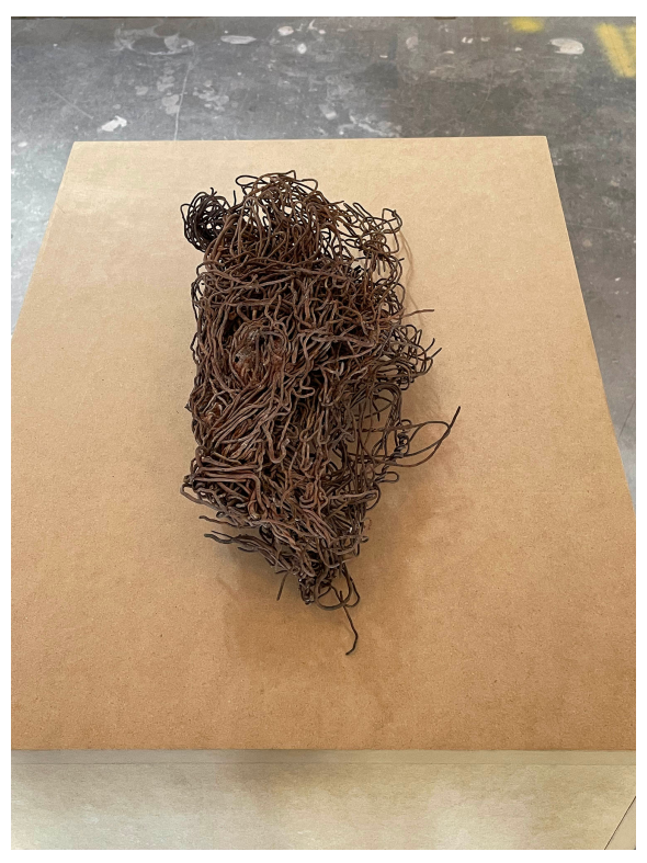
101 Greenwich Street: Christopher Wool, See Stop Run, 2024, Installation View