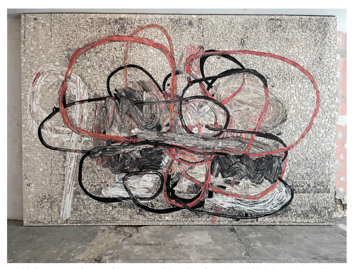
101 Greenwich Street: Christopher Wool, See Stop Run, 2024, Installation View

SOLO SHOWS March 20, 2024 7:24 am Contributed by Adam Simon