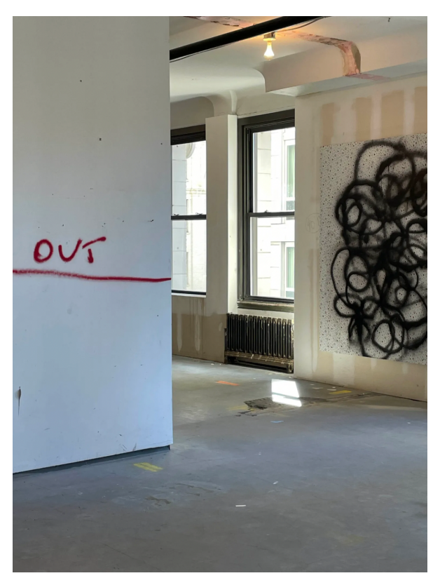
101 Greenwich Street: Christopher Wool, See Stop Run, 2024, Installation View